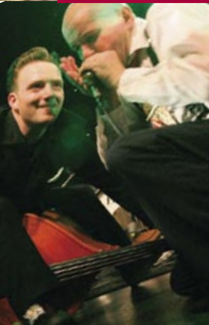
The Cadillac Kings