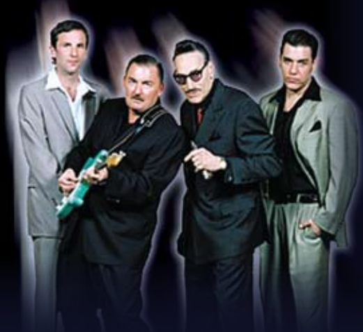
Little Charlie & the Nightcats