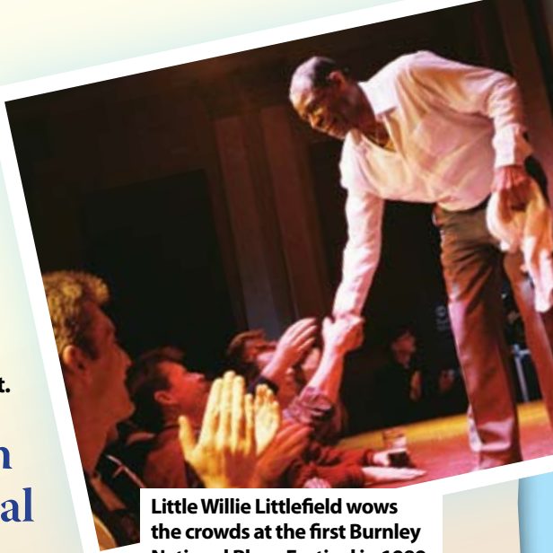
Little Willie Littlefield wows the crowds at the first Burnley National Blues Festival in 1989

On Thursday 21st March 1989 Little Willie Littlefield, ably supported by the Big Town Playboys, headlined the 1 st Burnley National Blues Festival. Little Willie brought the house down and introduced the British public to a new and exciting generation of international Blues Festivals. From that moment the Burnley National Blues Festival became the birthplace of the modern British blues festival movement.